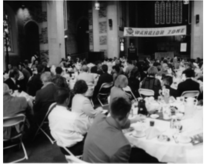
Over 120 student-athletes, faculty and staff enjoyed the first annual Student-Athlete Recognition Banquet held in April, 2001.

In conjunction with academic advisors in the University