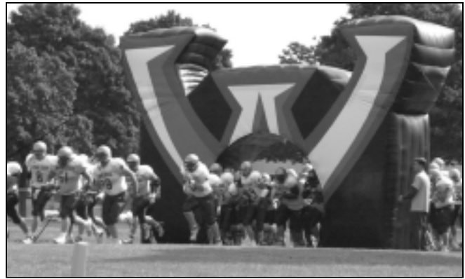
Wayne State football players run through the inflatable "W" introduced for the 2001 season.